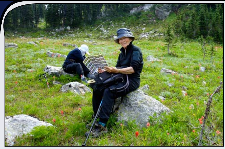
it while the going is good!

The team at Revelstoke Ski Touring knows all too well the importance of a well-fitting day pack, while out on your winter adventure. First, measure your torso length. To do this, ask your friend to measure from the bump on your spine at the bottom of your neck, C7, to the middle of your hip bones, your iliac crest. Remember to stand straight while measuring. For a day pack, we suggest a 30 litre pack with an internal frame. Packs are gender specific – get the right one! Hip belts need to be comfy, as they support 80% of the pack's weight. Look for ventilation between your back and the pack. Packs that have attachment points for hiking poles, ice axes, and crampons are very handy. A water bladder or water bottle is vital for staying hydrated. Ensure wide-mouth openings – keep in mind the ease of filling them up and having easy access to them. Consider if the pack will have multiple uses - biking, mountaineering, heli skiing - or is it just your hiking pack? The material should be durable to take the rigors of the wilderness. Personally, I prefer a top-loading day pack instead of a panel folding pack – they are lighter! Take your time choosing a pack by adjusting the straps, bending over with it, walking up and down stairs with it, etc.